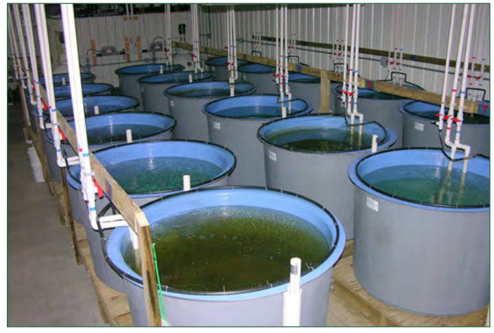
Here are two of the seven recirculating systems in the ARDF wetlab. Each of these tanks are 1000-L and can be randomly assigned to either of the systems in this array to optimize our experimental design.